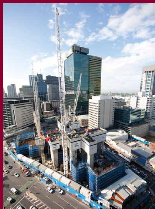
Brisbane Supreme and District Court complex.

The state's flagship courthouse project has been allocated $290 million in 2010–11. The Supreme and District Courts complex in the heart of Brisbane will cost an estimated $600 million over five years and create almost 5,000 jobs during construction, both on and off site. Its design sets a new benchmark in courthouse security, justice technology and environmental efficiency. It also delivers unprecedented facilities for victims of crime, vulnerable witnesses, jurors and members of the public. The project is scheduled for completion in 2012.